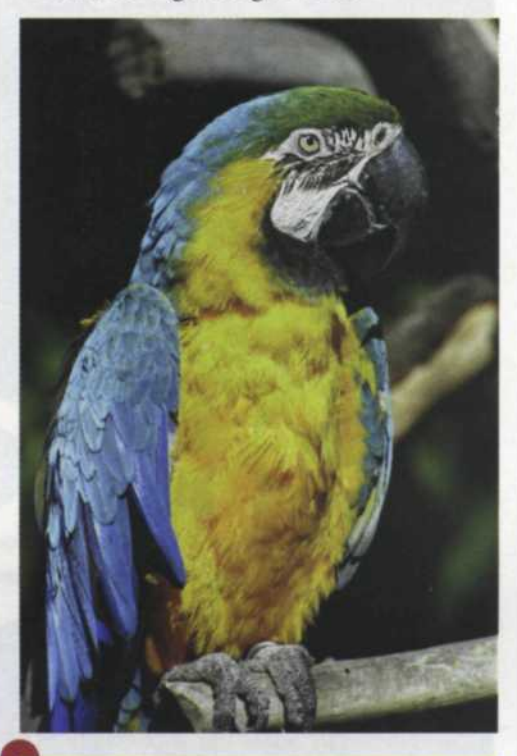
Portra adds saturation to subtle colors (top), and enhances colors even in shade (above).

introduced Portra 160NC, 160VC, 400NC and 400VC color-negative films. The 160NC and 400NC emulsions were offered as solutions for normal and lower-light situations, respectively, where natural flesh tones were the main concerns for accurate color reproduction. The 160VC and 400VC were used for the same lighting situations, but where an added vivid color rendition was required. As the technology was perfected, Portra 800 was introduced for low-light situations like existinglight work at weddings. For situations where tungsten lights were the main light source, Portra 100T was the answer, allowing photographers to shoot without light-robbing correction filters. Finally, for those who like to mix in some black-and-white images and print them on the same color paper, Kodak offered the chromogenic Portra 400BW emulsion.