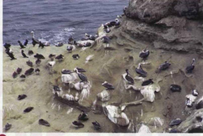
More good stuff: Portra 400UC holds detail well in high-contrast scenes (left), provides needed punch in flat lighting (above), and captures beautiful saturated color (right). And it does it all with amazingly fine grain for its high ISO 400 speed, which makes it easy to get great image quality with a wide range of subjects in a wide range of shooting conditions.

emotional experience. The very first shirt that caught our eyes was one from an Oregon fire department. Since we are based in Oregon, we quickly turned the camera into the vertical position so that we could capture the shirt, flag, and the Statue of Liberty. This would be an excellent test for the Portra 400UC, because the lighting was very contrasty and the colors were extremely bright.